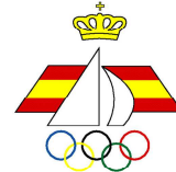
Royal Spanish Sailing Federation

If a sailor is unable to present this, he/she will be charged a fee of € 70. € 10 of which will be retained by the collecting Spanish National Secretary of Laser Class or his representative, € 10 for ILCA, to cover administration, € 50 will be passed on to the sailor's district, who may refund it to the sailor if he/she is already a current member, or may put it towards that sailor's membership fee if he/she is not a member.