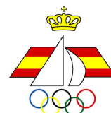
Royal Spanish Sailing Federation