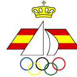
Royal Spanish Sailing Federation